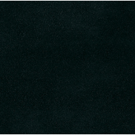
Black Velvet - 02